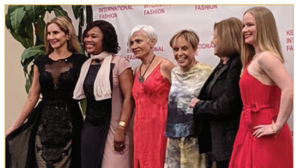
On occasion, the members of the Association up- their-game in fashion knowledge and trends.